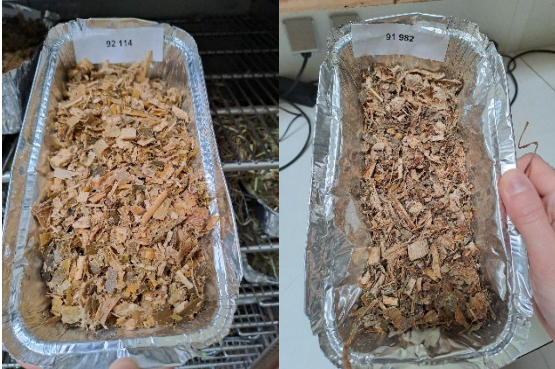
Image 3: Sample of grind corn. Original sample on the left and dried sample on the right side.

[Note technique 2026-005EN] / Olivier VARET, FROILABO