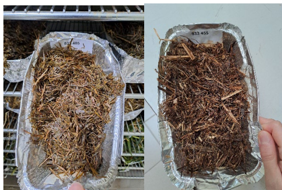
Image 2: Sample of grass. Fresh and humid sample on the left, and dried sample on the right.

Conversely, the presence of residual moisture leads to the formation of aggregates during grinding. Below are pictures (image 2 and image 3) of samples before and after drying.