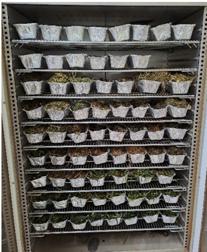
Image 4: Example of drying of a batch with oven. Considered as the reference.

Image 4 references a batch of samples in an oven before starting the heating process.